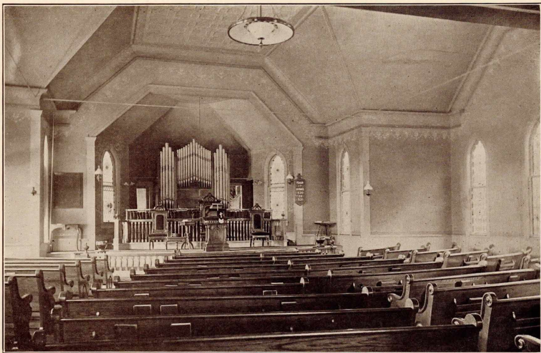
Interior Methodist Episcopal Church, Stamford, N. Y.