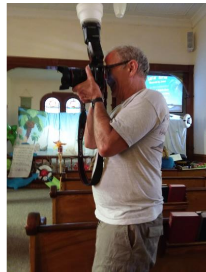
Our official photographer!