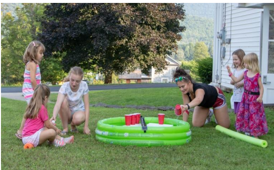
Water & Splashing Fun!